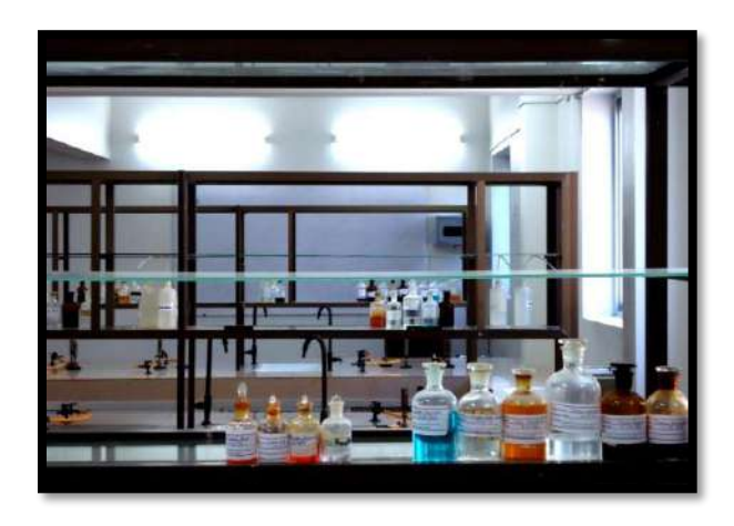
Pharmaceutical Chemistry Lab