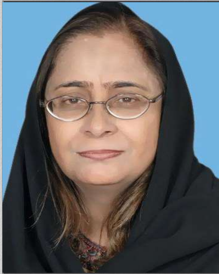
DR. AZRA FAZAL PECHUHO Minister of Health Government of Sindh